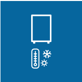
4 operations modes