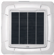
Cover PB-950HE4 (opcja)